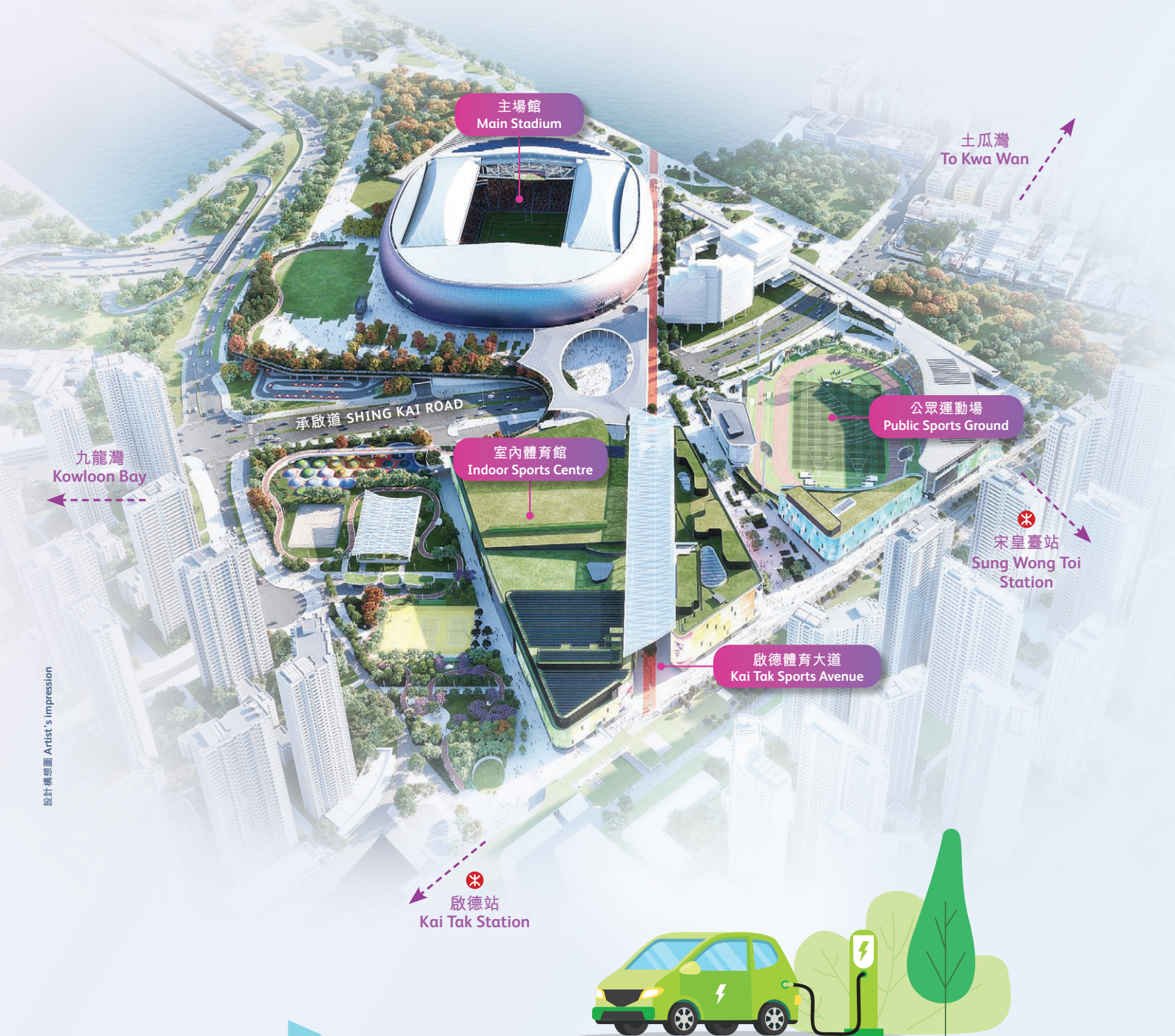
設計構想圖 Artist's impression