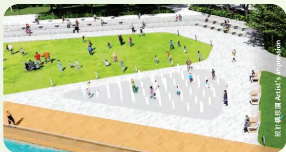
嬉水廣場 Water Play Plaza