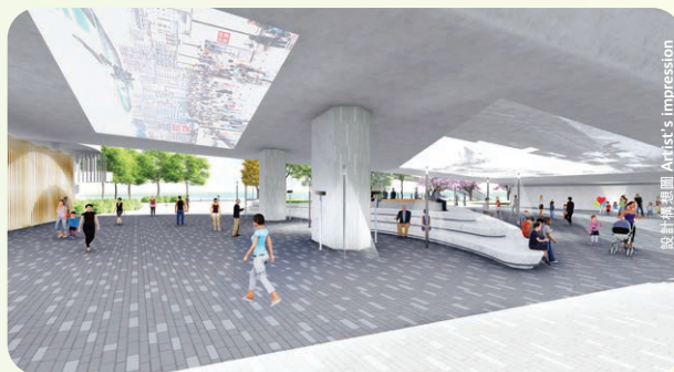
多用途活動空間 Multi-purpose and Seating Areas