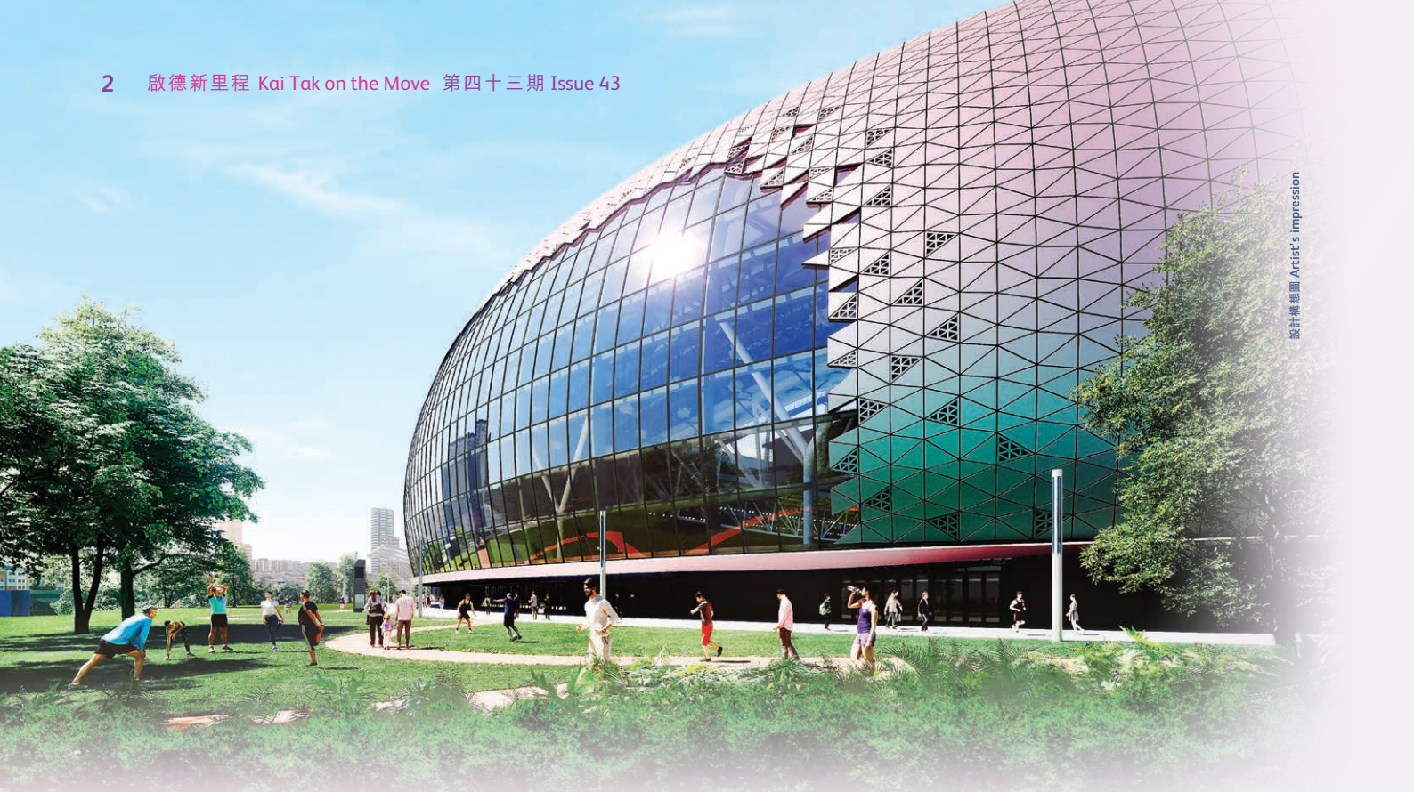
設計構想圖 Artist's Impression